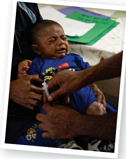
RECEIVING A VACCINATION IN THE CLINIC

Some of the tracks we are driving pass through coffee plantations, rainforest and village gardens. We collect another two mums and their babies and continue on. The ride is rough and rugged, we all have our feet firmly planted and are holding on tight. A carton of eggs would surely be scrambled by now.